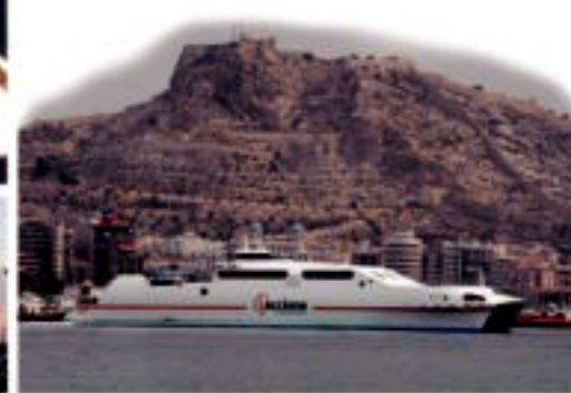
The vessel before becoming HD1

The Incat K-Class range of vessels are recognised around the world for their speed, economy and technical reliability and HD Ferries' HD 1 is the youngest of three similar vessels.